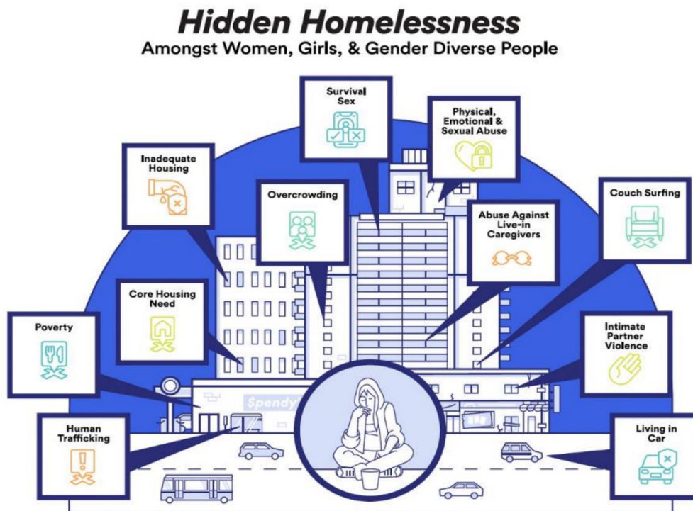
Figure 1: Hidden Homelessness Amongst Women, Girls and Gender-Diverse People.

36. This failure to capture the unique experiences of women and gender-diverse persons within federal definitions of homelessness and chronic homelessness likely contributes to gender-based inequities in funding, and contributes to severe gaps in supports, services, and emergency housing. Further, it means that women and